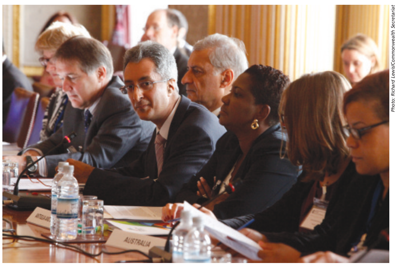
Second Commonwealth Global Biennial Conference on Small States, September 2012, Marlborough House, London

underpinned the litany of Africa's development challenges. The report articulated publicly the widespread concern in development circles about the detrimental impact of state capture, rent-seeking and unaccountable political institutions on state capacity and developmental effectiveness.<sup>7</sup>